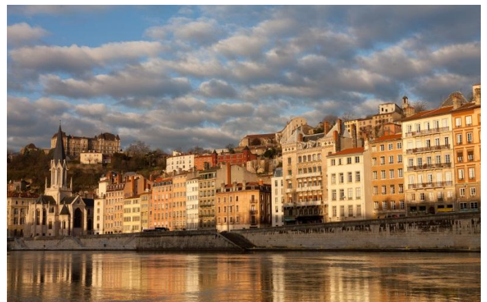
The Saône Quays