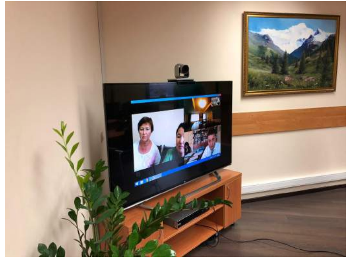
Meetings and Skype conferences with the C3QA project partners