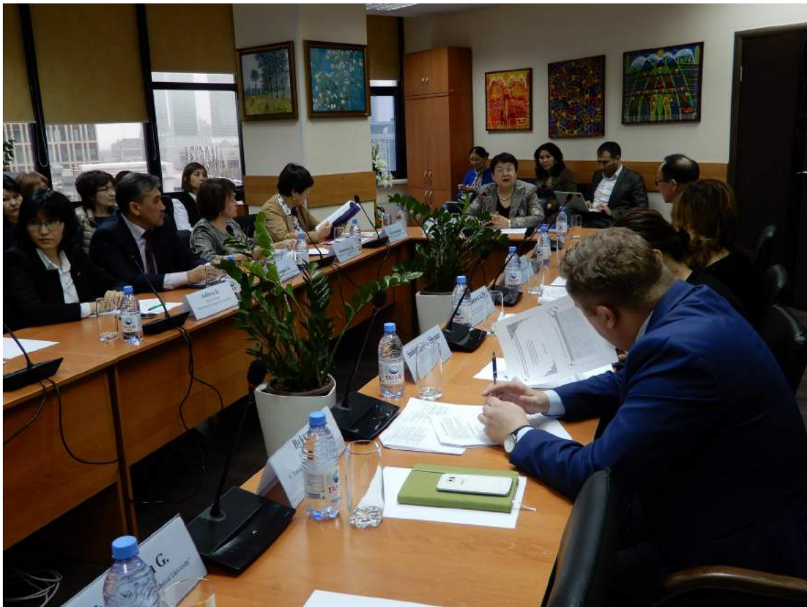
National discussion on amendments to the legal and regulatory framework relating to the doctoral training in higher education in the framework of the C3QA project

On March 11-12, 2019, in accordance with the C3QA project working plan, the IQAA accredited the educational program of the "Chemical technology of inorganic substances" doctoral program of the M. Auezov South Kazakhstan State University. On March 30, 2019, Accreditation Council of IQAA made a decision to accredit this doctoral program for 5 years. On March 13-14, 2019 a site-visit of IQAA experts for the accreditation of the "International Law" doctoral program at the M. Narikbayev KAZGUU University was held.