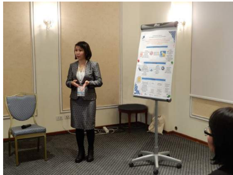
Presentation of the poster for the project "Promoting the internationalization of research through the establishment and operation of a quality assurance system for the third cycle in accordance with the European integration agenda (C3QA)" at the ENQA General Assembly (October, 2018)